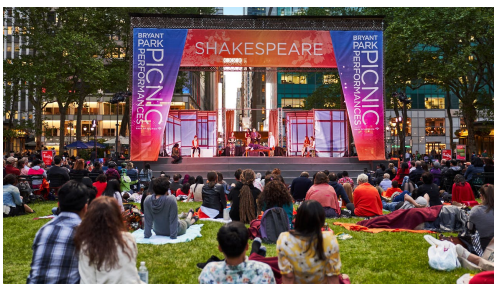
Bryant Park Picnic Performances