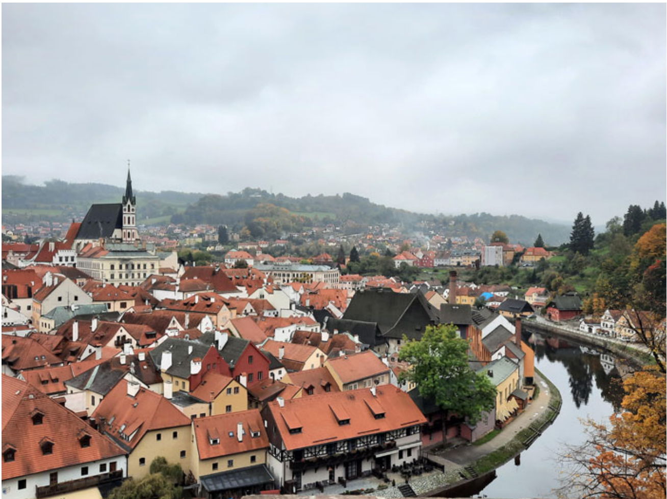
Cesky Krumlov is a UNESCO Heritage site.