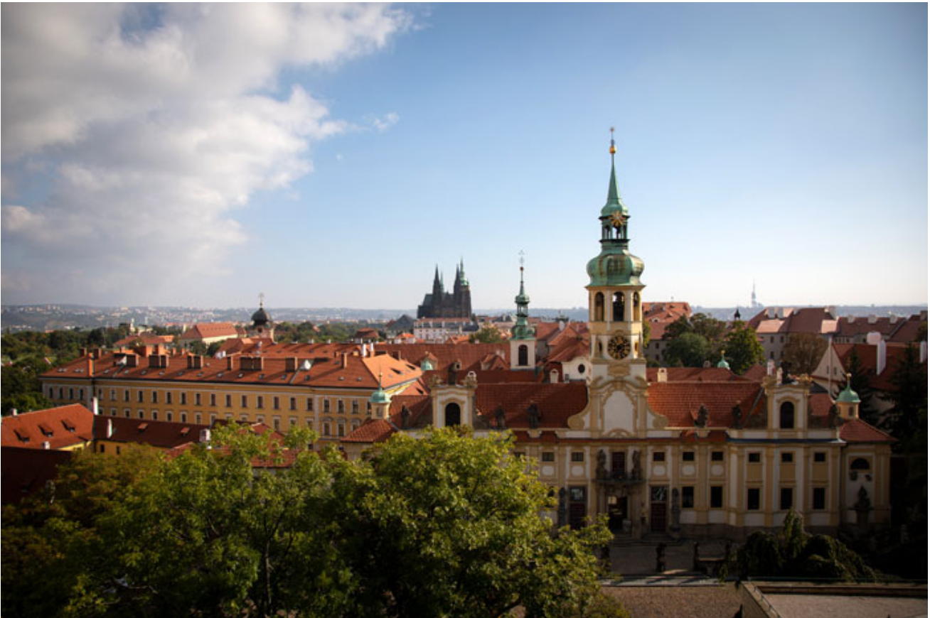
Many of Prague's historic buildings have been preserved.