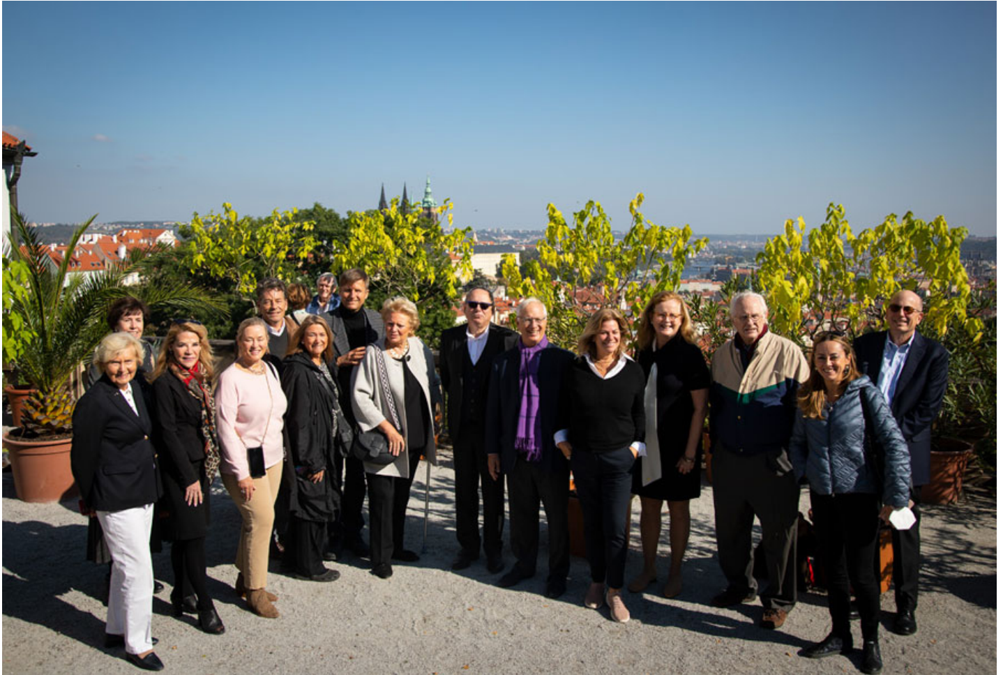
American Friends of Versailles on the terrace of Strahov Monastery Library overlooking Prague.