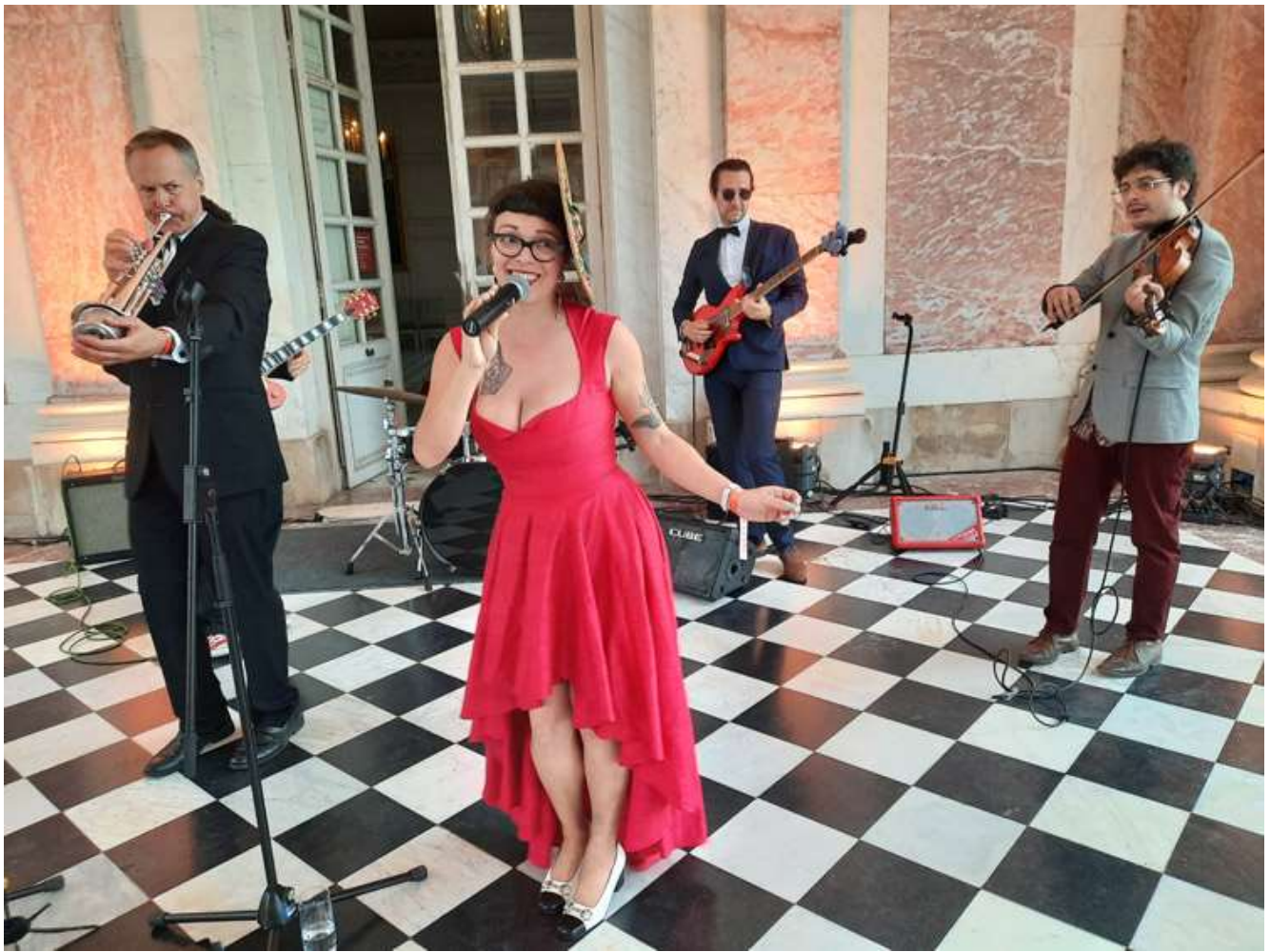
A band performed on the marble terrace.