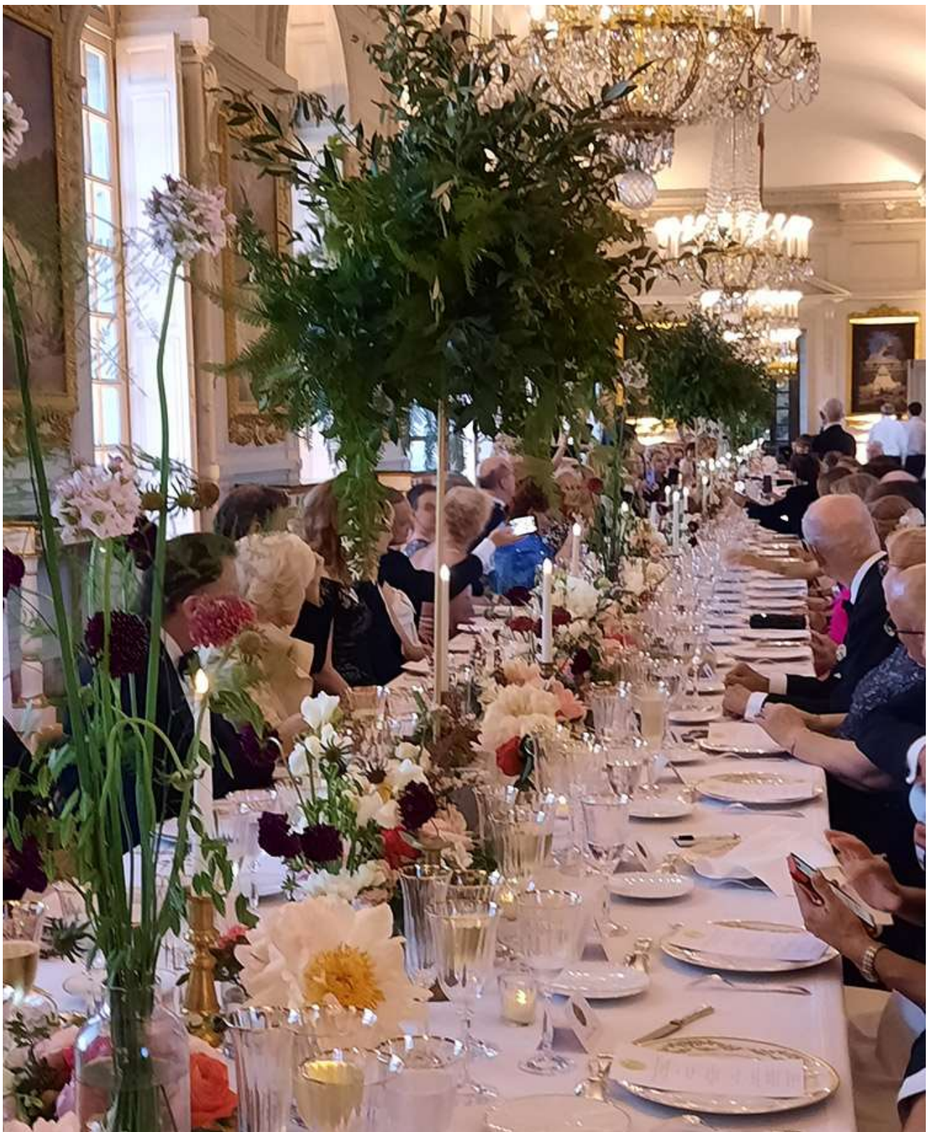
Guests were seated at one long table in the Galerie des Cortelle which is lined with pictures of the garden bosquets.