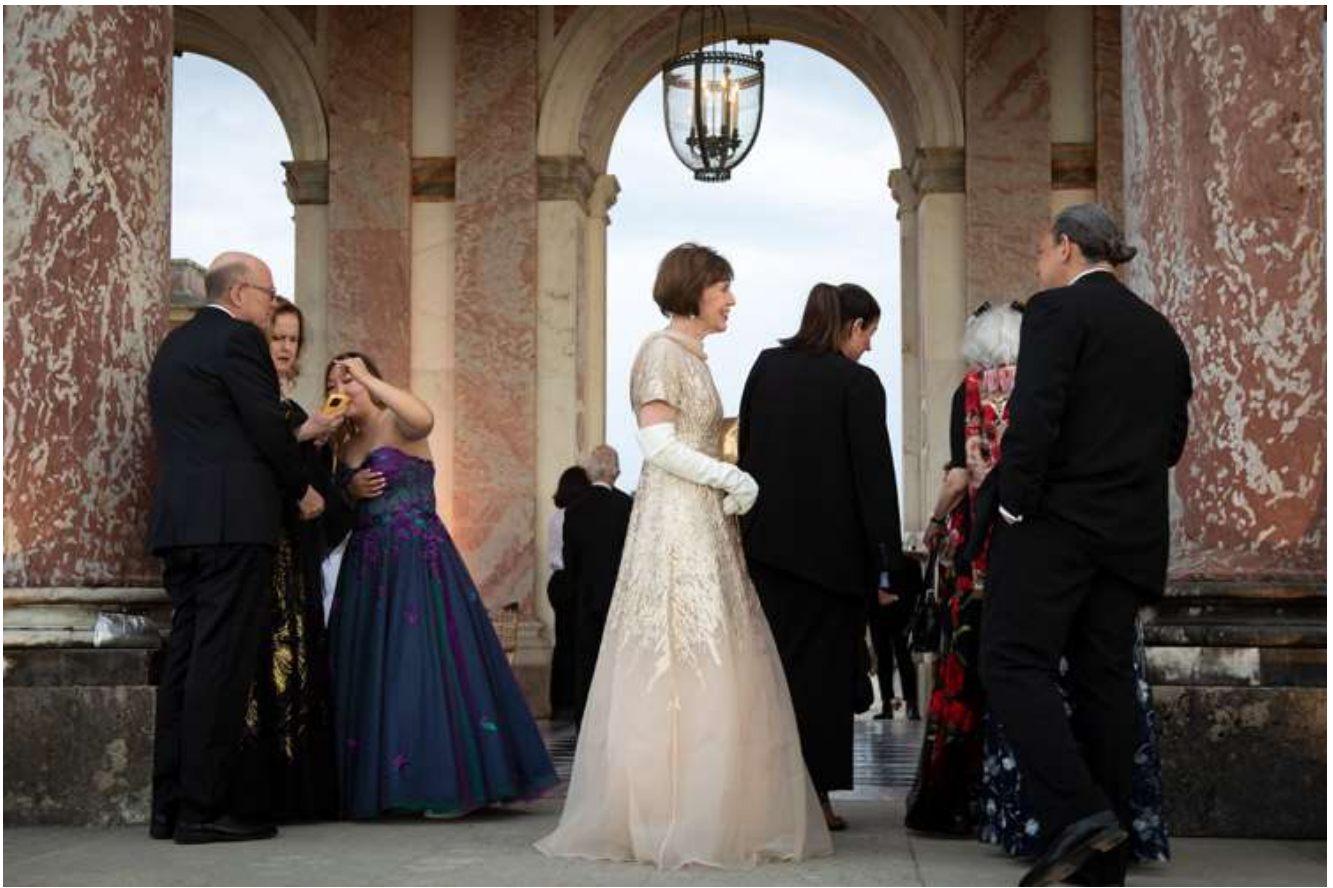
Greeting old and new friends.