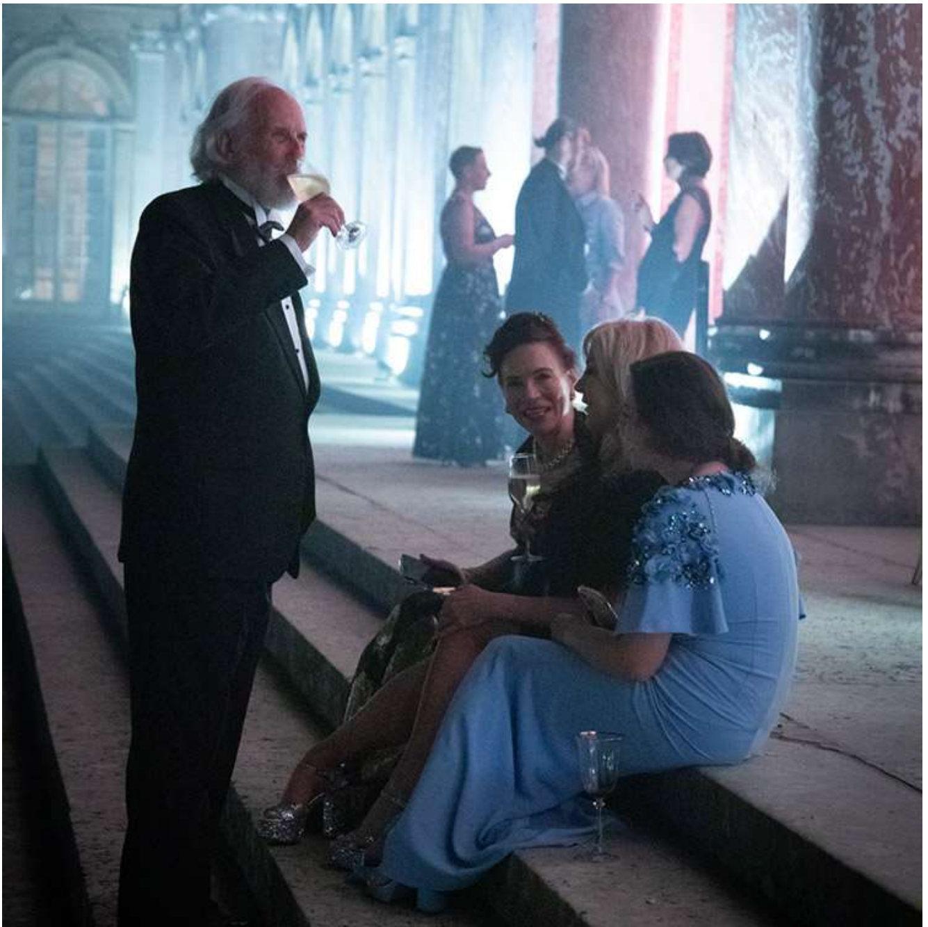
Sipping champagne while awaiting the fireworks.