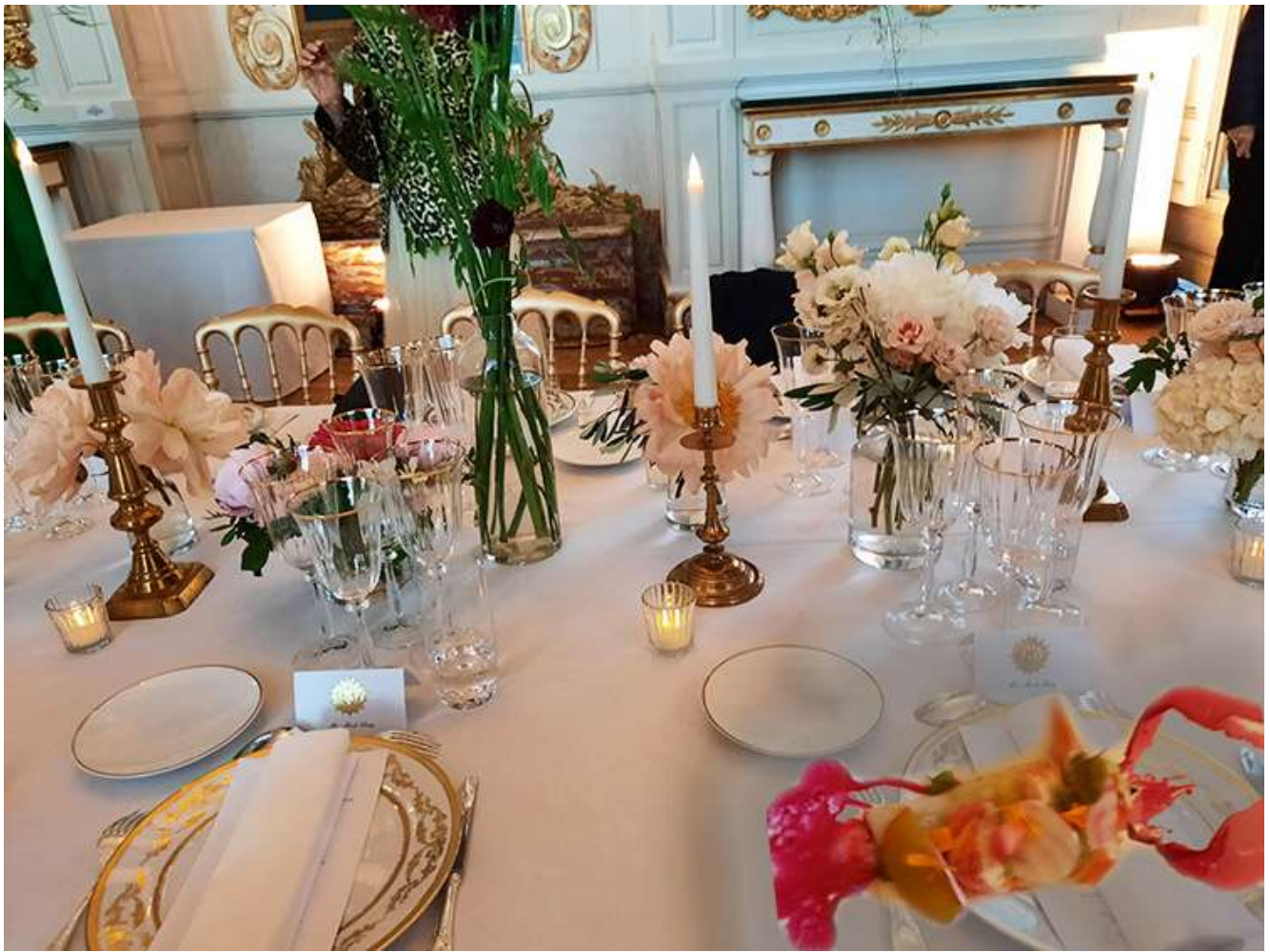
Colorful mini bouquets lined the table. Inset: The seafood salad was presented atop a lobster stenciled on each plate.