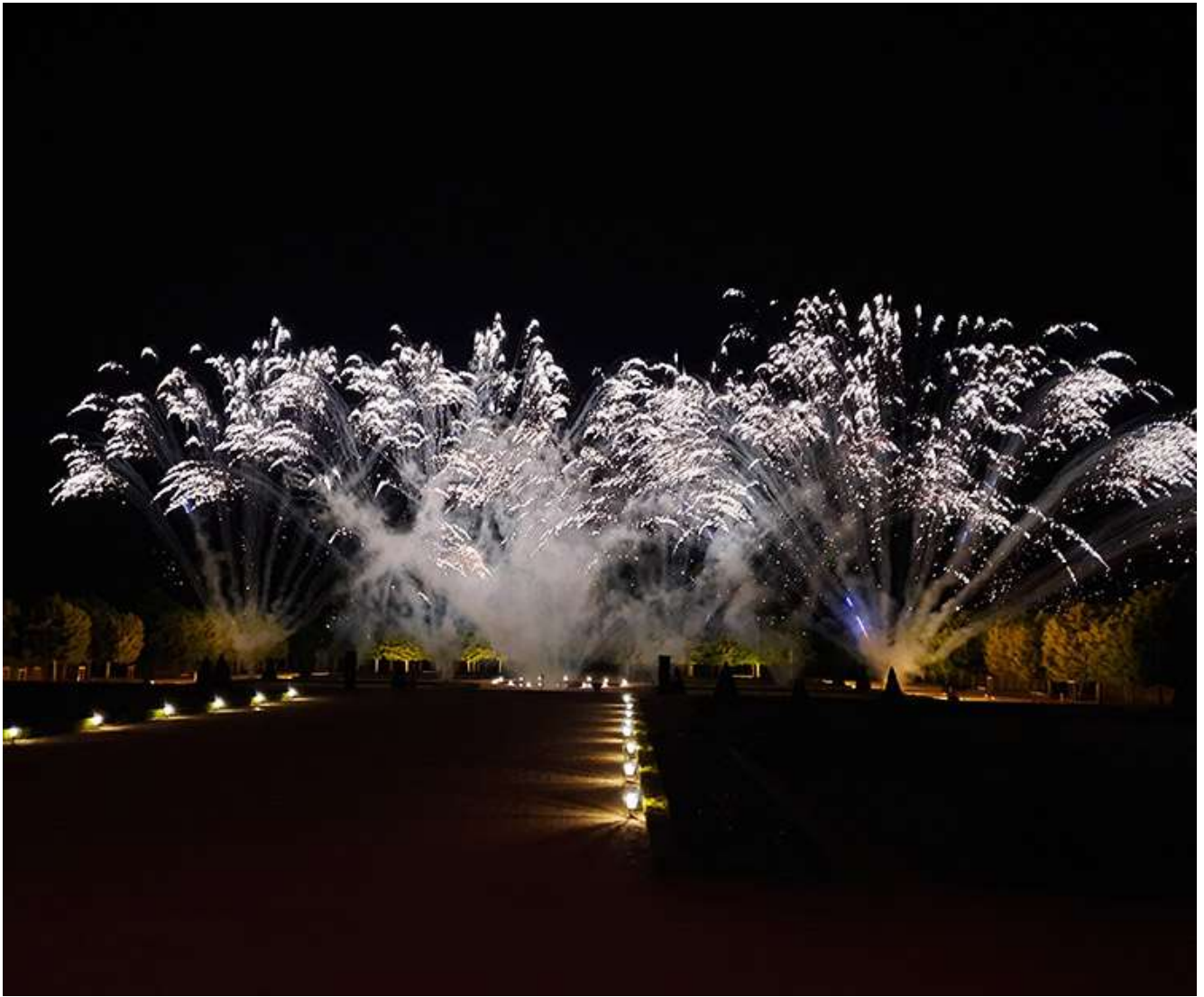
A concert of fireworks lit up a dazzling evening.